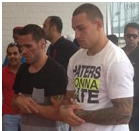
Boxer Anthony Mundine (left) and NRL player Blake Ferguson in Zetland Mosque, Sydney