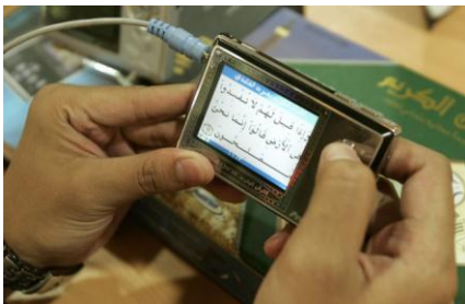
On a digital player in a bookshop in Jakarta, Indonesia