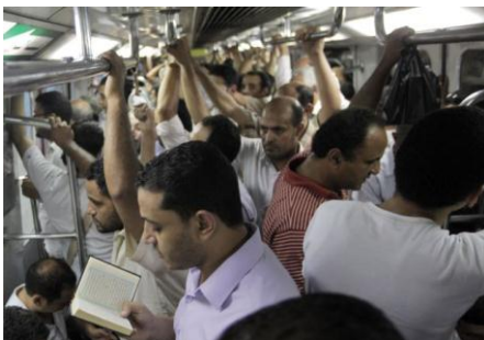
On the Cairo underground