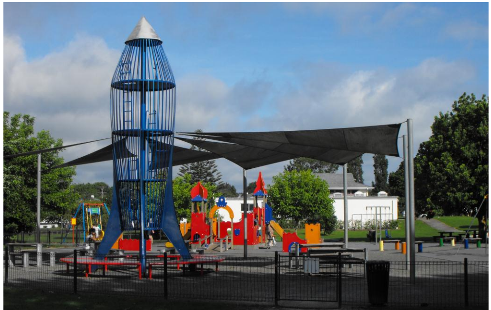
Rocket Park playground, with the Senior Citizens' Hall in the background

1 Elesha Edmonds. End of an era for Mt Albert's Senior Citizens Club. Central leader , 16 September 2015. http://www.stuff.co.nz/auckland/local-news/central-leader/72114934/end-of-an-era-for-mt-alberts-senior-citizens-club