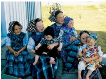
Hutterite women and girls

In a post to the World Hijab Day Facebook page 1 (now unavailable), a writer named Chelsea Flores points out the history of women covering their heads (hijab).