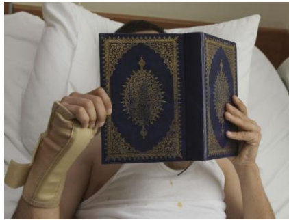
A Syrian refugee in hospital in Antakya, Turkey