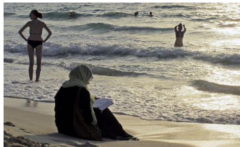
On a beach in Dubai