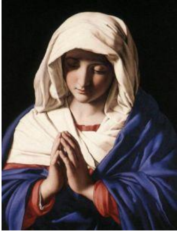
Painting of the Virgin Mary (Mariam, ra) by 17 th century Italian painter Sassoferato