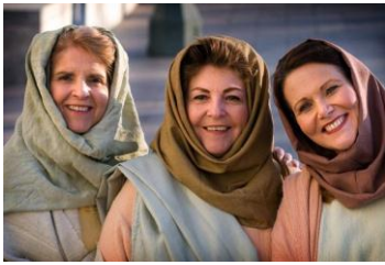
Orthodox Jewish women