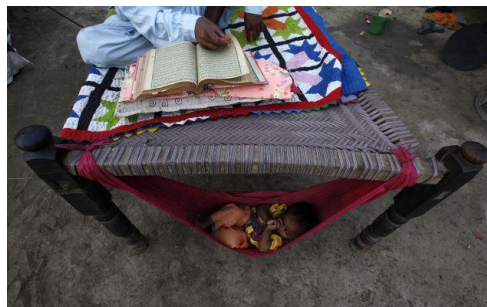
A relief camp for flood victims in Sindh province, Pakistan