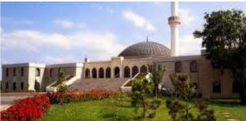
Islamic Centre, Vienna

1 Austrian burqa ban takes effect ahead of general election. RT, 1 October. www.rt.com/news/405214-austria-burqa-ban-law