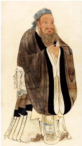
Ming Dynasty (16 th century) painting of Confucius (Kong Qui)

The Prophet (saw) also said, "A Muslim is one from whom whose tongue and hands other Muslims are safe. A mumin (true believer) is one in whom the wealth and lives of all the people are safe."