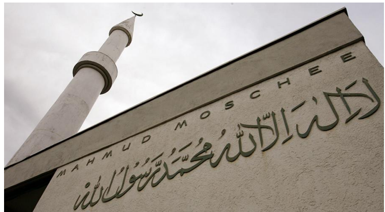
Mahmud Mosque, Zurich

1 Crackdown on Swiss mosques: Safety strategy, discrimination or waste of tax money? RT, 1 October. www.rt.com/news/405174-switzerland-mosques-terrorism-debate