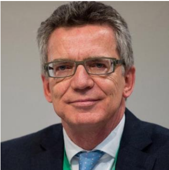
Thomas de Maiziere

A predictable Islamophobic backlash has come from various politicians. Alexander Dobrindt, the head of the conservative Christian Social Union CSU faction in the German federal parliament, claimed, "Our Christian legacy is non-negotiable. Introduction of Muslim public holidays in Germany is out of the question." The idea of a monolithic, dominant Christian culture in Germany has been debated and ridiculed recently; see the suggestion that "Only sausages" united Germans 2 .