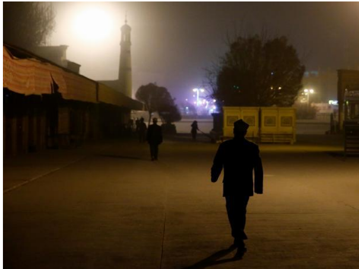
Men walk to the Id Kah Mosque for morning prayers in Kashgar

www.rfa.org/english/news/china/muslims-ramadan-06142017134547.html