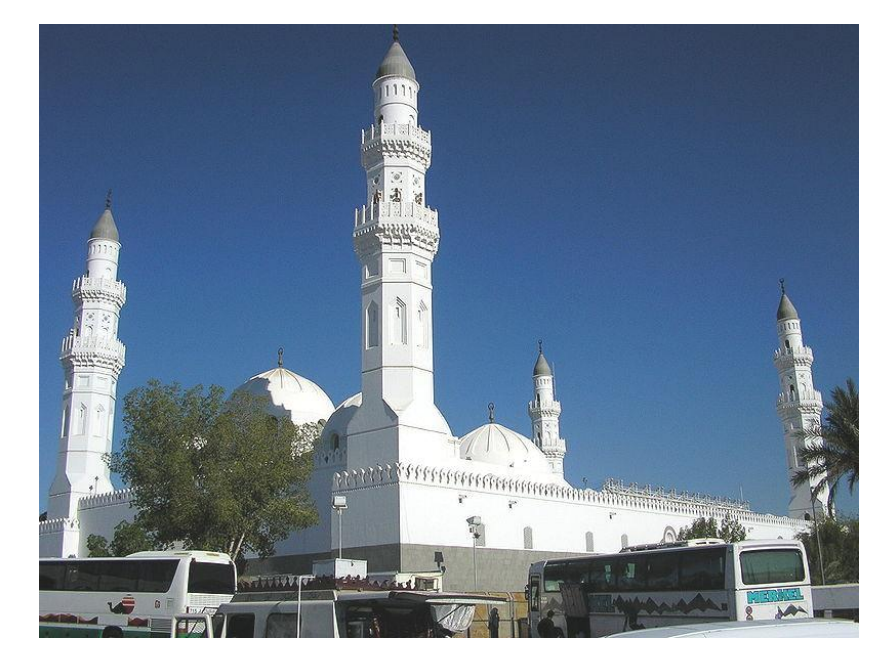
Masjid Quba, Madinah, the first mosque ever built

Hence, we have to keep in mind the relevance of the prophetic Hijra to our own lives. If we live in a place where our faith and our very life is in danger, we have to move away. We are told in the Holy