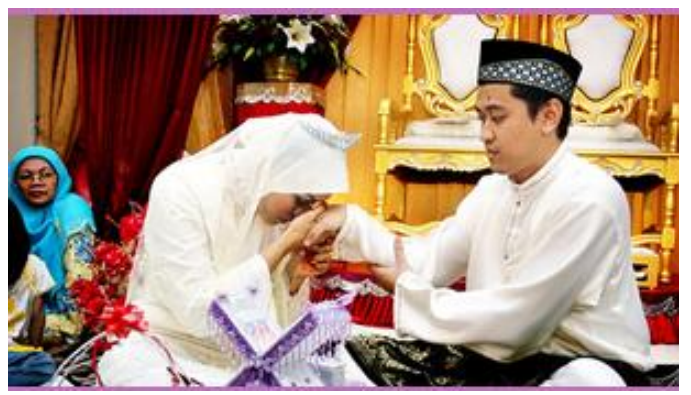
Muslim wedding, Brunei Darussalam

We have examined the evidence about homosexuality and marriage from the Bible and Quran. While the Bible is not totally clear, and has led to misinterpretations by some people, the Quran leaves no doubt that homosexuality is a sin (transgression), and that sexual relations must be between a male and a female, that are married.